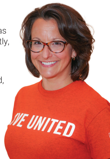
President & CEO

Please enjoy this report of our inaugural year together and remember...United We Thrive!