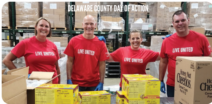
DELAWARE COUNTY DAY OF ACTION