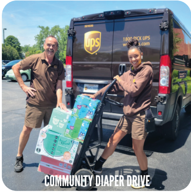
COMMUNITY DIAPER DRIVE