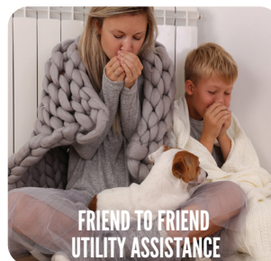
FRIEND TO FRIEND UTILITY ASSISTANCE