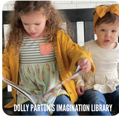
DOLLY PARTON'S IMAGINATION LIBRARY