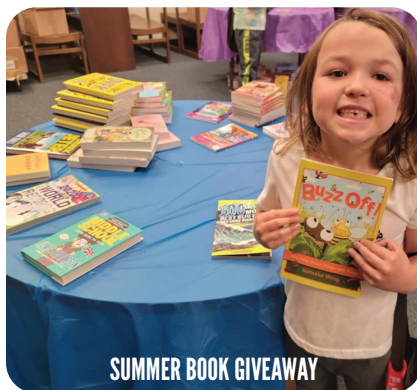
SUMMER BOOK GIVEAWAY