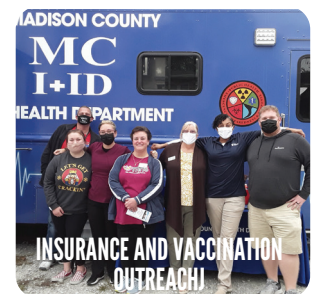
INSURANCE AND VACCINATION OUTREACH