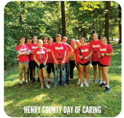
HENRY COUNTY DAY OF CARING