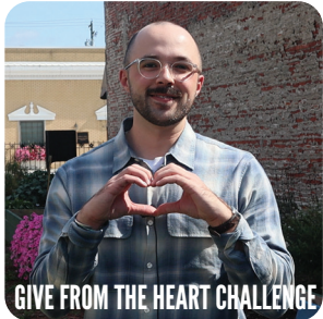
GIVE FROM THE HEART CHALLENGE

Donor dollars, community partnerships, volunteer service and the dedication of many all worked together to impact our community in big ways this year. Here are some highlights of the ways that support made a difference.