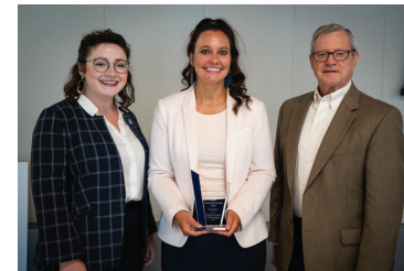
George and Frances Ball Foundation, awarded the Community Builders Award