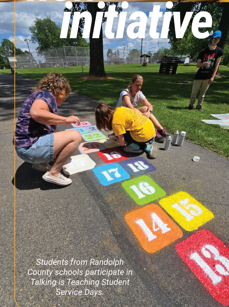
Students from Randolph County schools participate in Talking is Teaching Student Service Days.