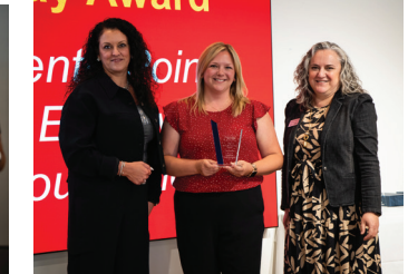
CenterPoint Energy Foundation presented with the Spirit of United Way Award