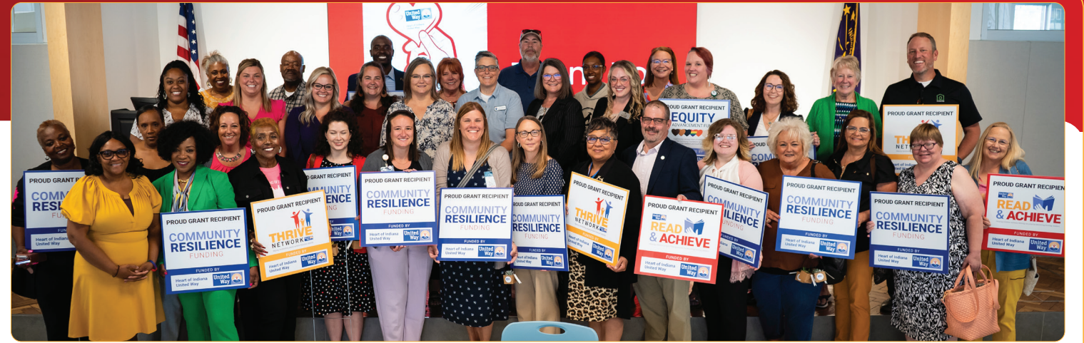
Many of the grant recipients at the Grants and Gratitude event came together for a group photo

At the event, we also awarded the first five grant recipients of our new Equity Advancement Fund. This fund aims to promote equity within the community, ensuring that everyone has access to the resources and opportunities they need to thrive.